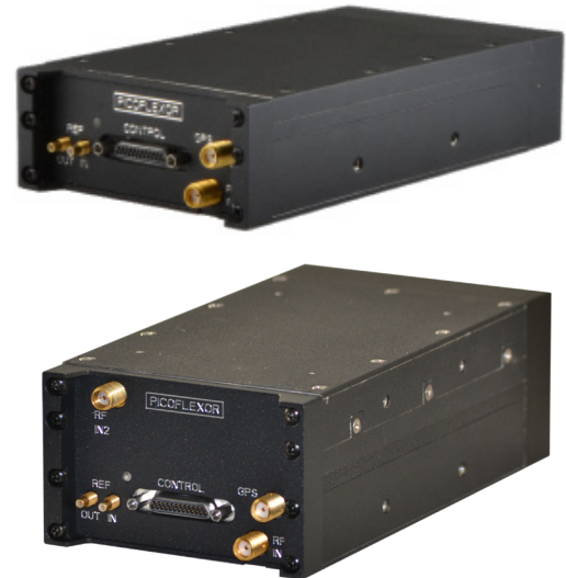
The Software Developers' Kit is compatible with both the single and dual channel PicoFlexors

Cleared by DRS for Public Release under case number 13-DS-074 dated June 14, 2013. Export of DRS SIGNAL SOLUTIONS, INC. products is subject to U.S. export controls. Licenses may be required. This material provides up-to-date general information on product performance and use. It is not contractual in nature, nor does it provide warranty of any kind. Information is subject to change at any time. Copyright © DRS SIGNAL SOLUTIONS, INC. 2013 - 2018. All Rights Reserved.