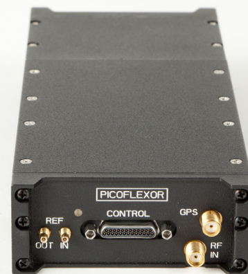
Single-channel PicoFlexor with aft-end processor module for application development through standard 1-Gig Ethernet and JTAG I/O interfaces.

The system builds the target System Software to include the Linux kernel, drivers and applications and it establishes the specification for the VM and the virtual Linux operating system. It can be edited to add serial ports or disk drives or to change memory requirements. The VM is an Ubuntu 12.04 long-term support installation containing OS-related applications and files.