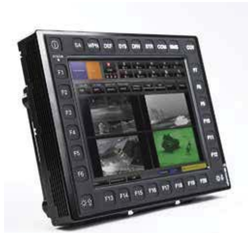
Leonardo DRS GVA Compliant Rugged Workstation

By providing Leonardo DRS BMS hardware to Australian Special Operations Forces, soldiers will be given the most advanced generation of rugged and cyber-resilient computers that will give joint operability between the Australian Army, U.S. forces and allied nations. Special Forces will have unprecedented joint communication and situational awareness across the battlefield.