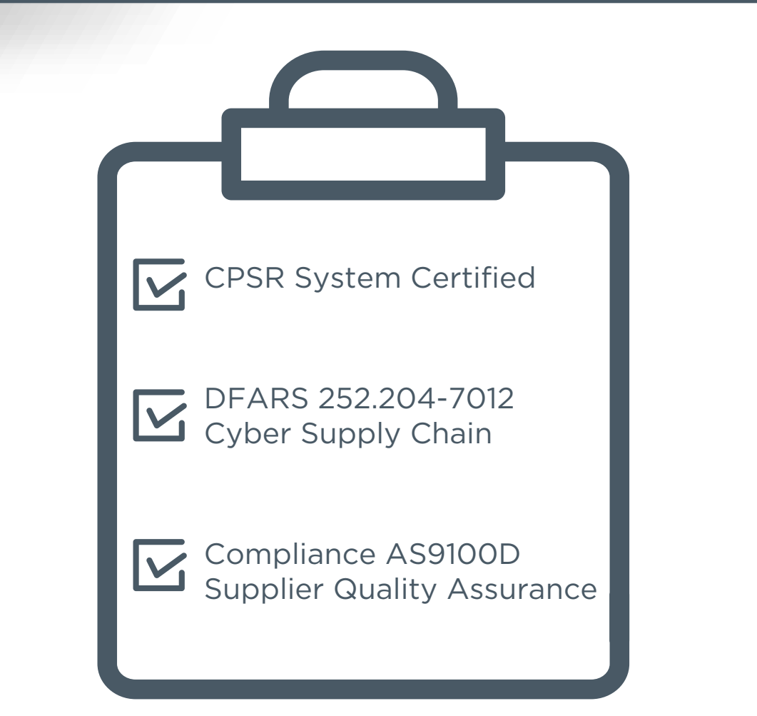
System Certifications and Compliance

Enabling our programs with a strategic competitive advantage in business pursuits and execution: