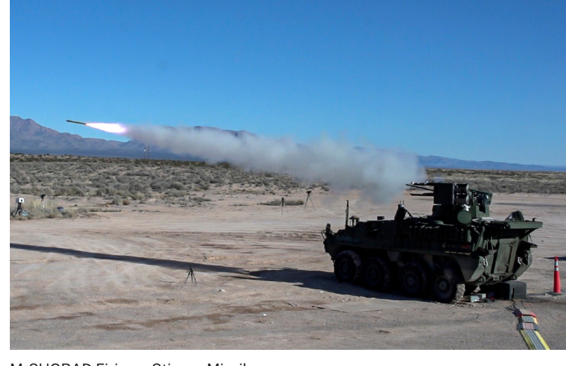
M-SHORAD Firing a Stinger Missile

This document does not contain any technology or technical data subject to U.S. export control. The products identified herein are controlled for export under the U.S. International Traffic in Arms Regulations (ITAR), 22 CFR 120-130, and may not be exported or transferred to any non-U.S. Person, country or entity, by any means, without prior written approval from the U.S. Department of State, Directorate of Defense Trade Controls (DDTC).