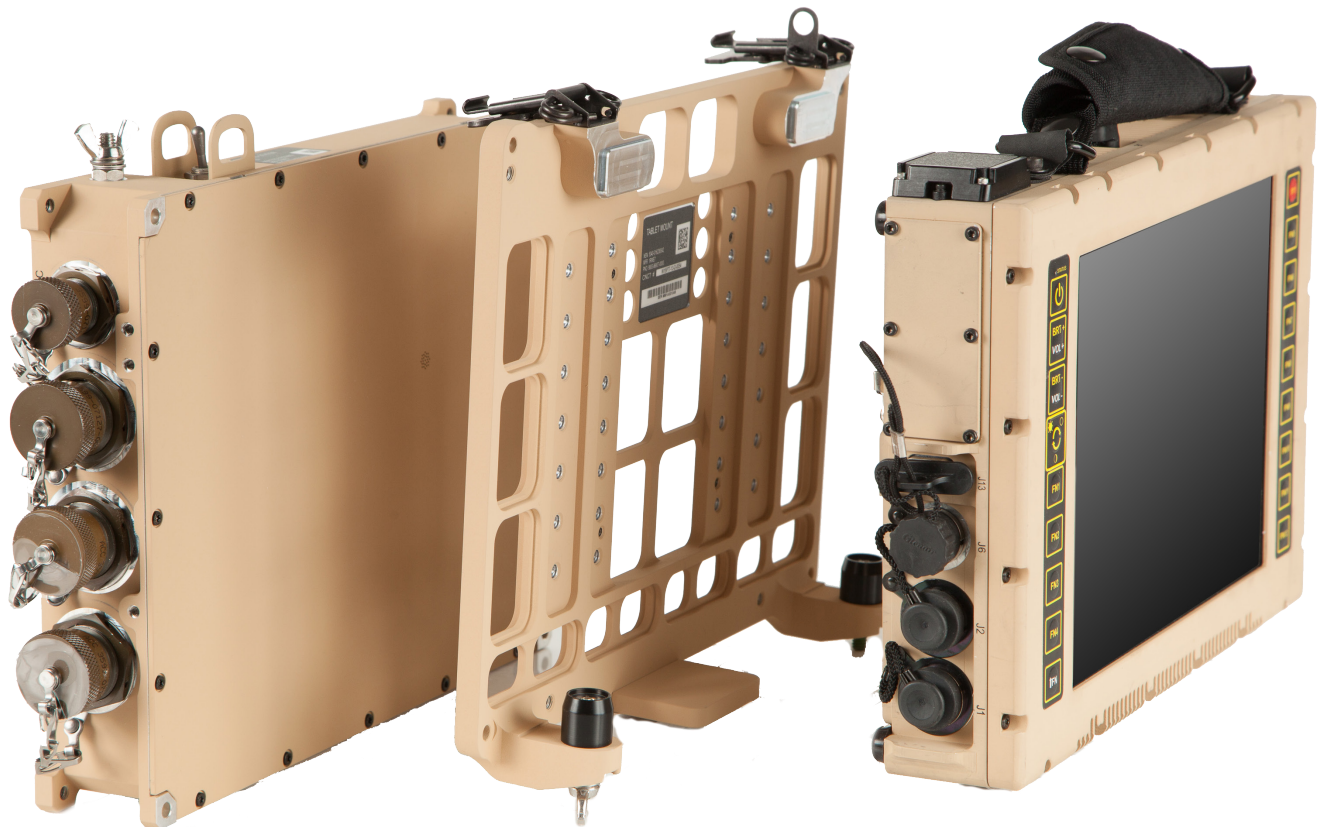
MRT104 with Vehicle Mount and I/O Expansion Dock

The MRT104 employs multiple embedded security elements that provide substantial protection against modern hardware focused cybersecurity threats. Technologies such as a Secure BIOS architecture, per-computer unique BIOS password assignment, digitally signed BIOS updates, factory provisioned TPM, Measured Launch environment, and secure storage of customer pre-placed keys are just a few of the unique security options. Security Deployment tools enable fleet implementation of Secure Boot and Self-Encrypting Drive technologies to protect data integrity and prevent unauthorized boot media.